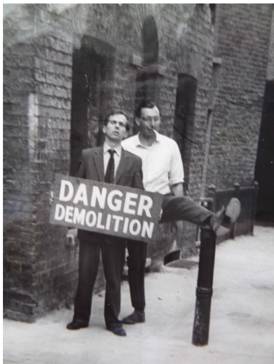
Figure 6. Post-grad protests in King Street, 1970.

King Street with records extending between 1851 and 1904 similar to those of The Boot Inn standing nearby.