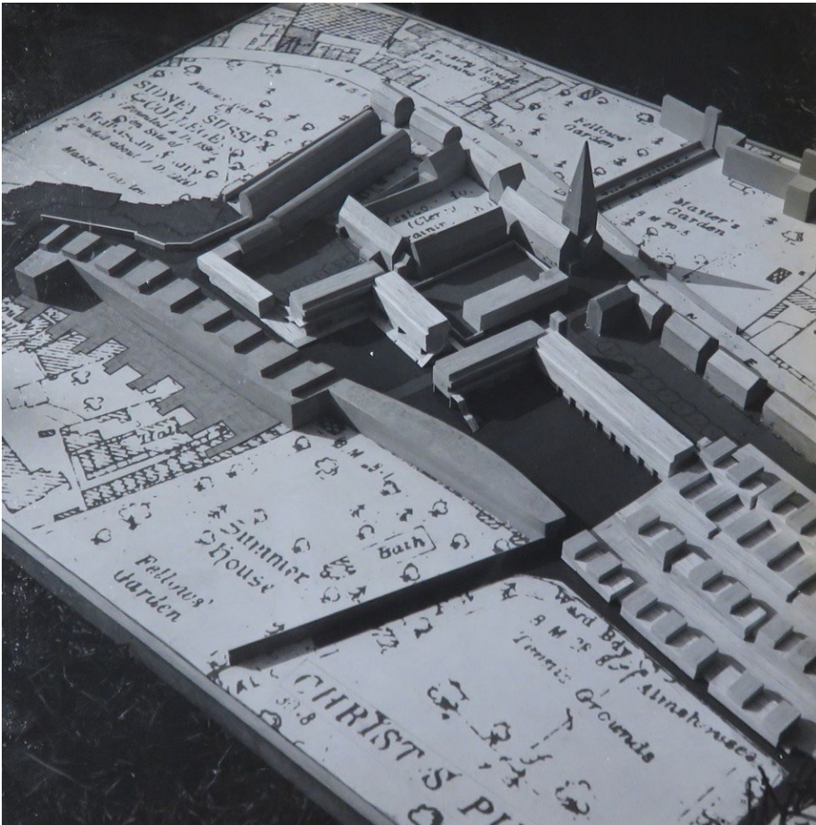
Figure 7. Model of full scheme to rebuild King Street (colleges are Jesus beyond All Saints Church spire and Christ's in foreground, Sidney Sussex to left; roughly the same area as in Fig. 1).

research; architects' plans and models are amid the documentary resources now available on-line together with the Head Porter's photos taken at the time of demolition work in progress. In the end, only about one half of the scheme was realised so the semi-abandonment has preserved much of the far end of the old street near to the surviving King Street Run and Radegund Arms pubs. In particular, the scheme's original intention had been to close-off the far end of King Street and to make the only exit from the area for vehicles via a new and widened Manor Street. Fortunately, however, you can still get out of King Street at the far end and reach the historic route via the Maids' Causeway to the Newmarket Road.