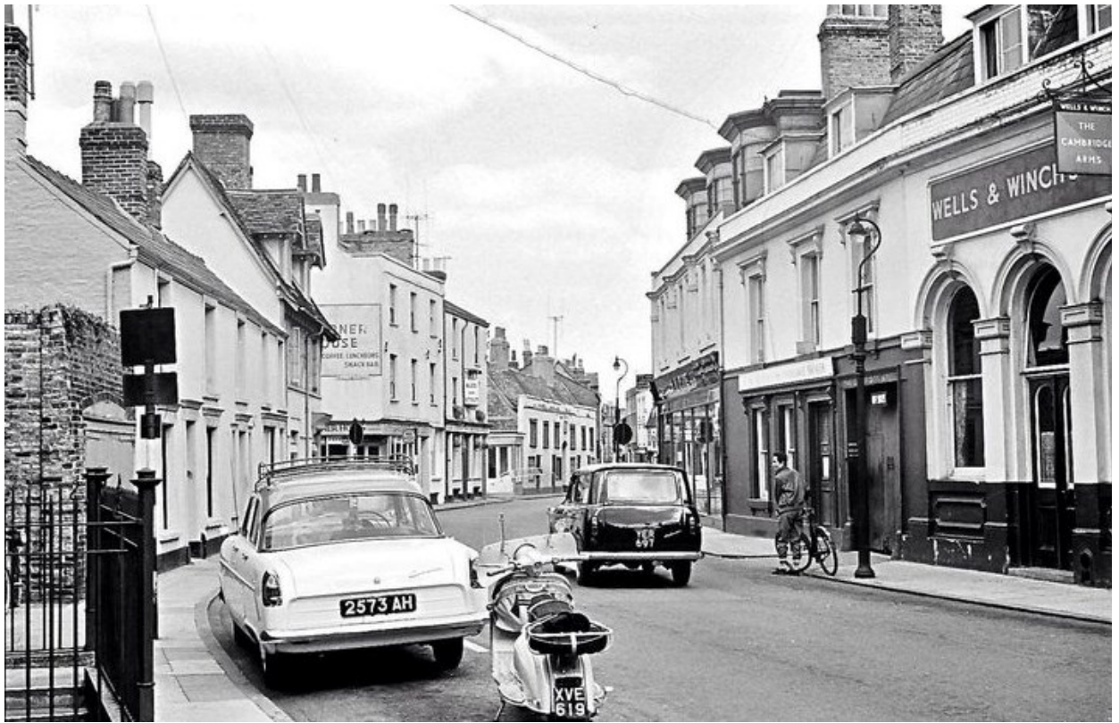
Figure 3. King Street in 1960s with Cambridge Arms and The Corner House in middle distance.

nearby as in Hobson Street. I know of two successful runs as reported by my 1963-66 group. As to me, I would not have dared to try it as four pints were about my absolute limit. The former Horse and Groom pub, with its fluctuating fortunes, has now changed its name to King Street Run and is currently thriving. It stands right in the middle of the Run's five best-known pubs as listed below alphabetically. Of these, a beer can still be found (COVID permitting) in four places of which only three are unchanged structurally. King Street is now well supplied with take-away drinks and licensed restaurants where wine has replaced beer to a large extent. The famed and much-loved-for-its-chips 'Corner House' also succumbed to the 1970s demolitions. It stood in an impressive three-storey brick building with a basement on the North side of King Street next to Malcolm Street (for those who wish to re-trace its former site) and it was run by a Greek or Cypriot family. There were no drinks, as was the common rule in the days of the Licensing Acts prior to their up-dating in the 1980s, but the absence of beer was not resented. Plenty of pubs stood nearby even though they had restricted hours of opening. A solid meal, including the chips, was bought for a few shillings (about 30 decimal pence) although other hungry students might prefer to go