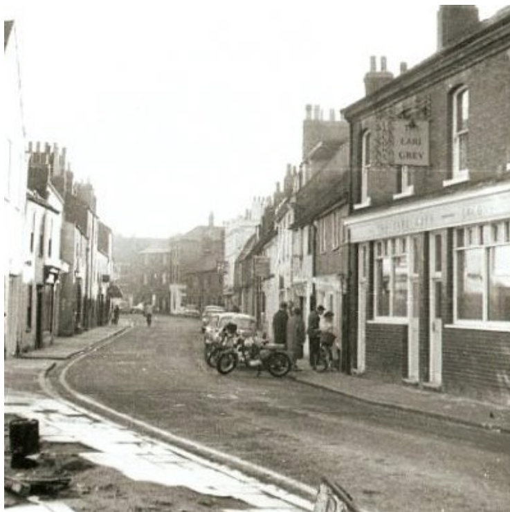
Figure 4. The Earl Grey (right) about the time the demolitions began.

Champion of the Thames : an establishment of mythical status that is adorned with photos of college athletes and other student memorabilia although it is now very popular with Cambridge regulars. Converted to pub use from a simple dwelling house perhaps about 1900 although this can be debated as some records trace it back as far as 1861 in pub use. There are two cosy, domestic-scale bar-rooms that make it ideal for a quiet drink. In the Sixties the beer was Greene King and was served from large barrels kept behind the bar. Early brewers were Star, then Bailey & Tebbutt followed by Greene King who supplied it from their Cambridge depot hence the sign outside that says 'Cambridge' rather than the usual 'Suffolk' ales. Recognised by Historic England and therefore its future should be secure.