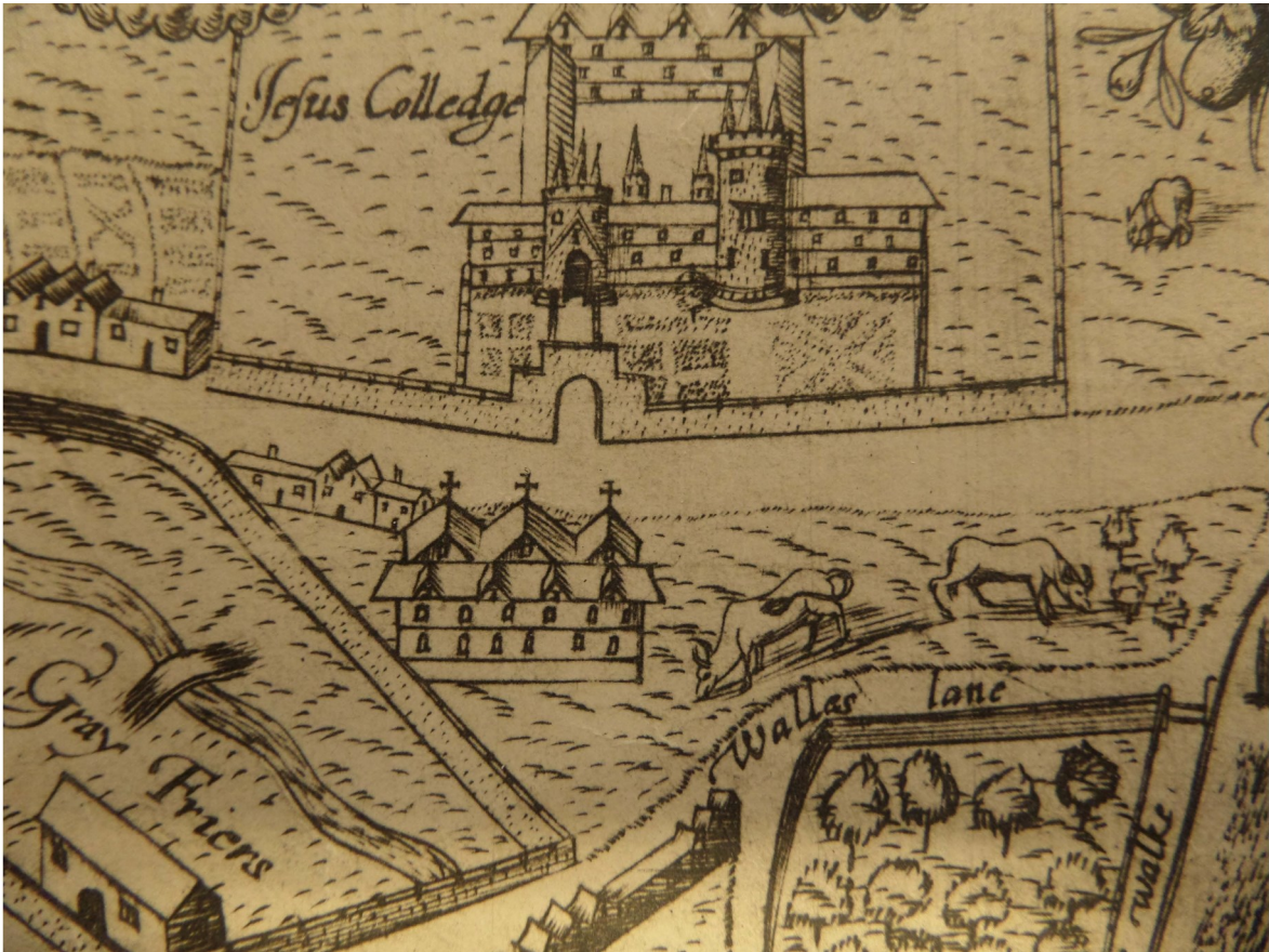
Figure 1. Richard Lyne's woodcut map (detail) with Christ's Fellows Garden beneath 'Lane'. 'Wallas Lane' as it was in the late 1500s. Below Jesus College the old Radegund Manor House is shown (demolished in 1830s) and this released land for the development as houses of the area. The lane runs between the Fellows Garden of Christ's and the old 'Gray Friers' soon to be renamed as Sidney Sussex College.

At this point the lane crosses the ditch now long buried under the roadway here. From the Hobson Street bend to the site of the Radegund Arms at the far end of the street is a distance of no more than 400 meters.